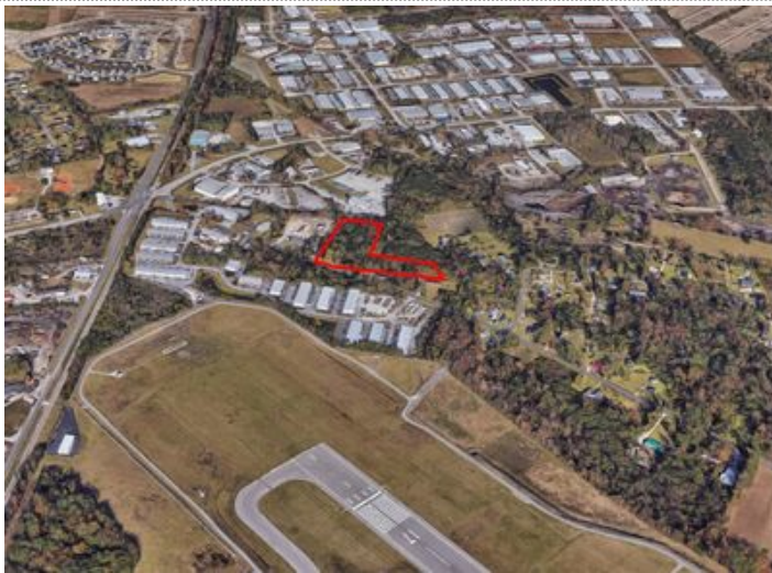
Google Earth Aerial- Parcels Outlined