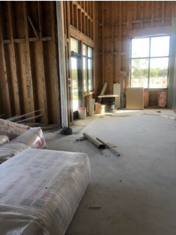
interior 420 sf