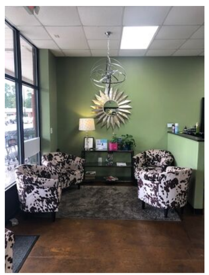
Hair Salon 4