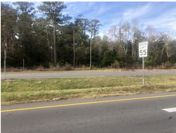
View of Property From Across the Street