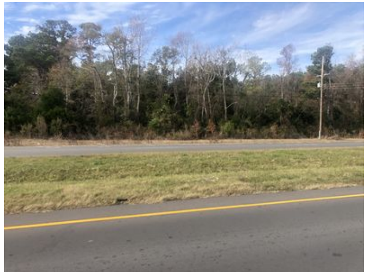
Property Frontage View