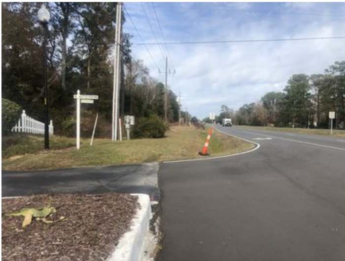
Looking North From Capeside Drive Toward Property