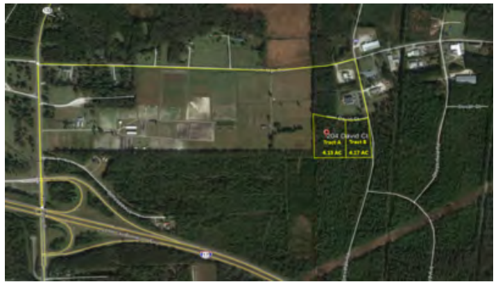
Highlighted Parcel & Access to highway