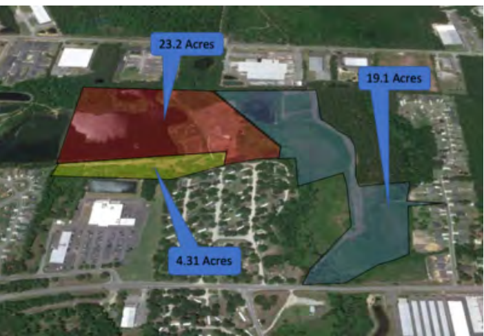
Mount Misery Road Residential Land for Sale Site is shaded yellow